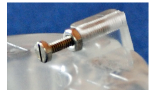
Fig. 4: Adjustment screw