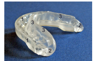
Fig. 3: Lower jaw tray